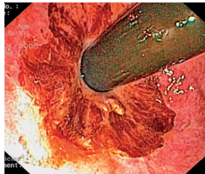
Fig. 2 Retroflexion vision: homogeneous brown coloration of the upper part of the anal canal after Lugol staining in a patient previously treated for a squamous cell carcinoma of the anal canal without macroscopic recurrence.