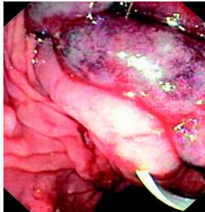
Fig. 2 Ampullary cannulation and biliary sphincterotomy.