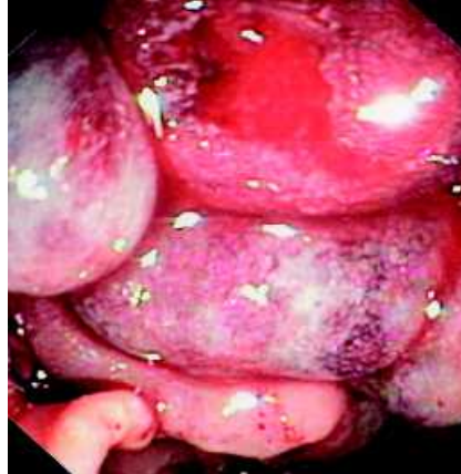
Fig. 1 Severe mucosal edema and hemorrhage.

Department of Gastroenterology and Hepatology, Westmead Hospital, Sydney, Australia