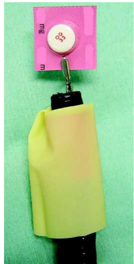
Fig. 4 A press-through package is grasped using straight grasping forceps with an endoscope.