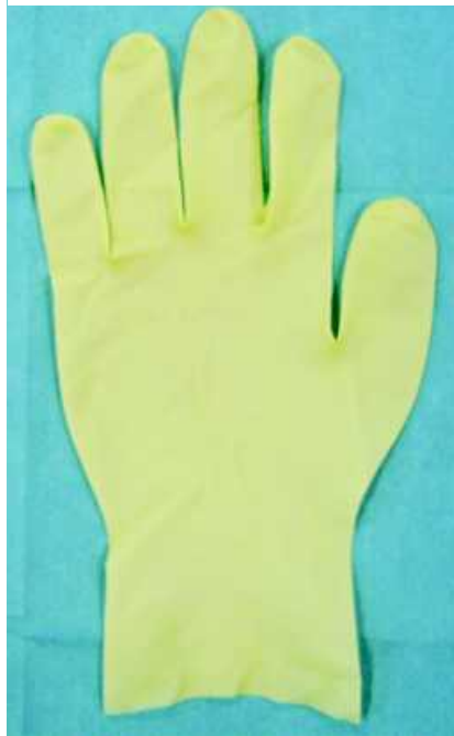
Fig. 1 A latex hand glove, which is generally used for endoscopy.