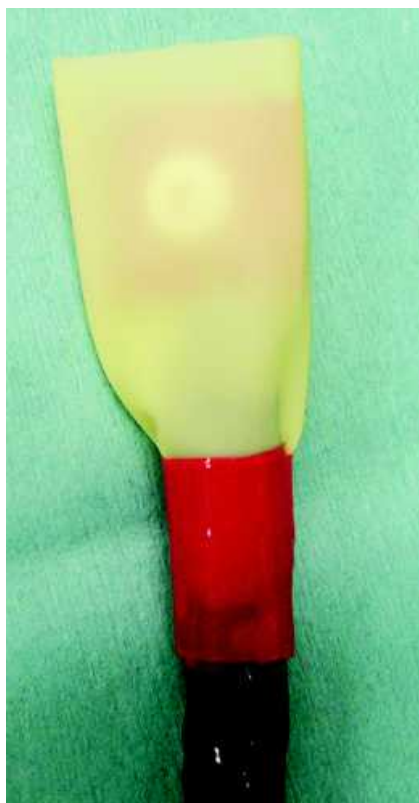
Fig. 5 The latex hand glove is automatically reversed and the press-through package is enveloped within the glove when the endoscope is pulled back.

S. Yoshida 1 , M. Shimada 1 , T. Ueno 2 , A. Kato 1 , M. Yoshino 1