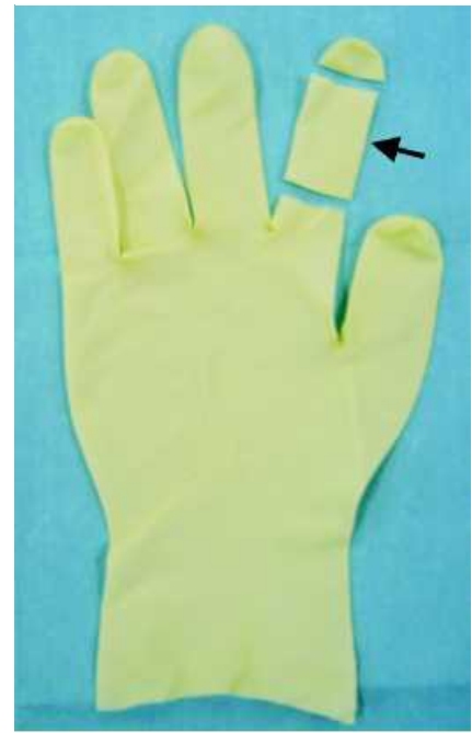
Fig. 2 The finger part is cut out of the latex hand glove.