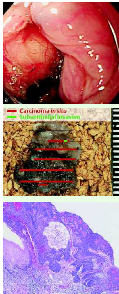
Fig. 2 Complete resection of the tumor by submucosal dissection (ESD). a After the ESD, the cartilaginous tissue of the epiglottis under tumor was visible through the transparent subepithelial layer. b Macroscopic image of the resected specimen. c Photomicrograph of the ESD specimen showing the lesion elevated from the epithelial mucosa and very slight invasion into the subepithelial layer (hematoxylin & eosin; original magnification × 200).

tients in the high-risk group such as heavy drinkers and heavy smokers [3], and of course it is necessary to cooperate with the otolaryngologist to treat.