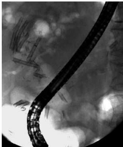
Fig. 2 Fragmented stents.