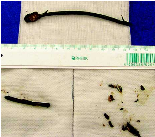
Fig. 3 Extracted stent particles.

Stent treatment of biliary strictures has become a common procedure, and inserting more than one stent (multiple stenting) has been shown to achieve better long-term success rates [1,2]. We report on a very uncommon complication of multiple stenting.