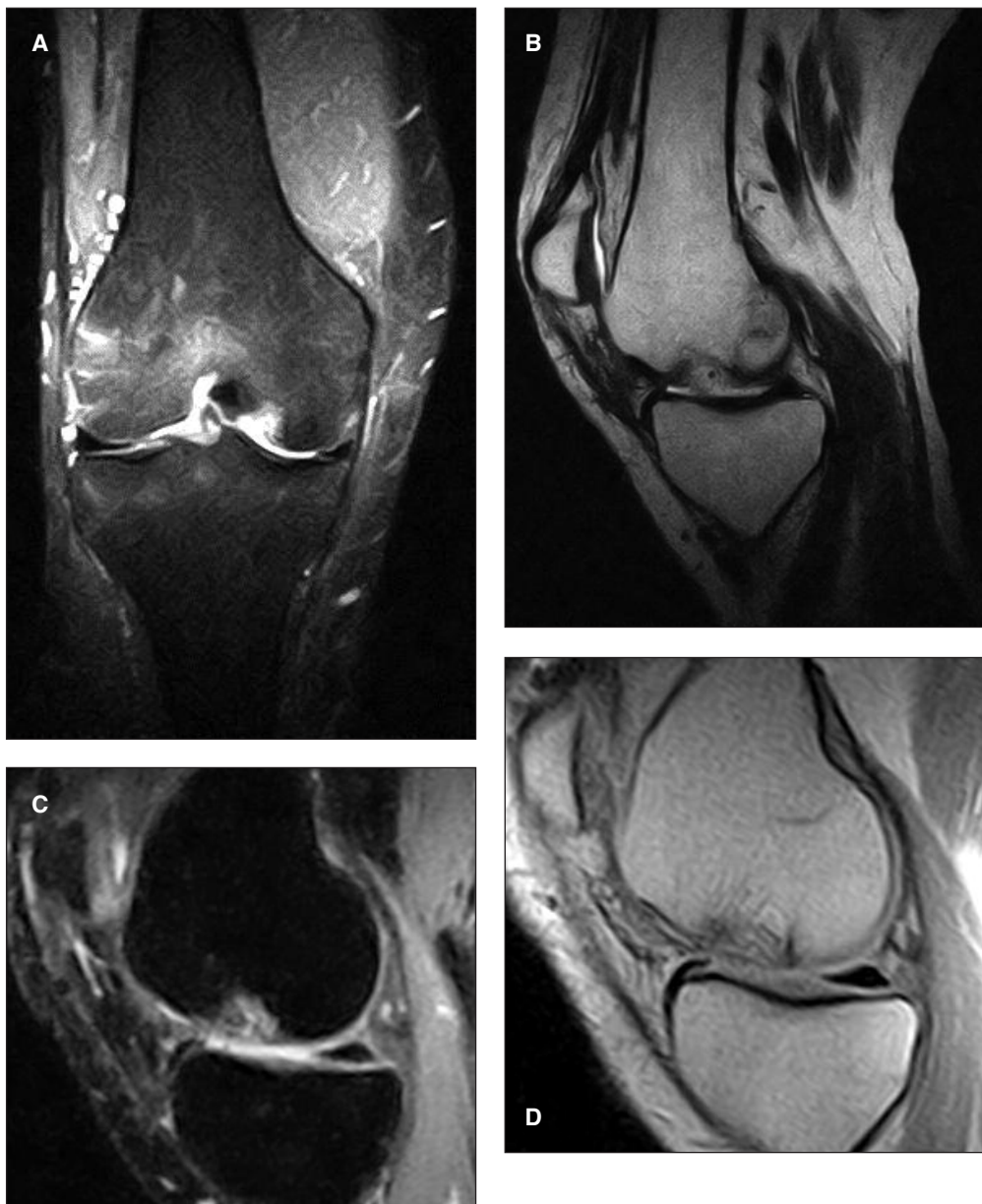
Fig. 3. Postoperative imaging of MaioRegen implantation. A-B: MRI follow-up at one year. It is possible to note the scaffold in situ and the ongoing differentiation process. C-D: MRI follow-up at two years. The scaffold is still recognizable at subchondral level, but the cartilage layer appears continuous and the subchondral bone shows no signs of edema.

fold itself) of bone marrow stem cells (31, 32). Various experimental studies, both in vitro and in vivo , have been published (27,30), but in our experience only two scaffolds are available in clinical practice for the treatment of osteochondral lesions. The first is a biopolymercomposite of poly (D,L-lactide-co-glycol-