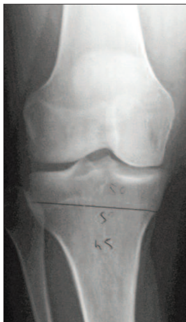
Fig. 1. Right knee. Proximal osteotomy line drawn preoperatively on a standard AP knee X-ray from a point 4 cm below the medial knee joint line to the tip of the fibular head.

slope. The patient was placed in the supine position on a radiolucent operating table and a tourniquet was applied. In all the cases, a diagnostic arthroscopic evaluation was performed prior to the HTO to evaluate the integrity of the lateral compartment of the knee. A 6-cm vertical incision was made over the center of the knee between the medial aspect of the tibial tuberosity and the posteromedial aspect of the tibia, just below the joint line. From the medial border of the patellar tendon, subperiosteal dissection was carried out towards the posteromedial aspect of the tibia, taking care to preserve the distal insertion of the superficial medial collateral ligament. Two guide wires were inserted in the standard fashion at a point 3.5-4 cm below the medial joint line and passed obliquely 1 cm below the lateral articular margin of the tibia towards the tip of the fibular head. Under fluoroscopic guidance, a tibial osteotomy was performed immediately below the guide wires using an osteotome. The surgeon always ensured that the osteotomy line extended to 1 cm medial to the lateral tibial cortex and was parallel to the posterior tibial slope on the sagittal plane. The mobility of the osteotomy site was checked with a slight valgus force and then the osteotomy line was opened according to the preoperative planning using a jack opener device consisting of two scalpels connected by a long screw. Subsequently, a calibrated wedge