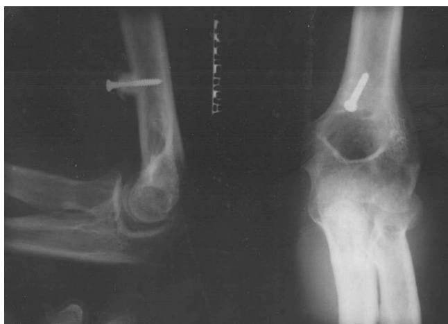
Figure 2 Steindler flexorplasty: proximal transfer (4 – 5 cm) and fixation of a piece of the medial epicondyle with its attached origin of the flexor-pronator muscle group in the middle of the anterior aspect of the humerus.

Functional improvement was scored using the criteria established by Alnot and Abols [2]. Two aspects must be kept in mind to evaluate the results obtained after Steindler flexorplasty: muscular power and range of motion.