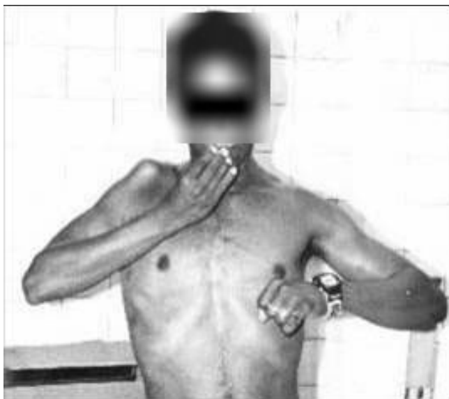
Figure 3 Case 7, after flexorplasty of the right elbow and arthrodesis on the right shoulder. Active elbow flexion to 135 degrees (Very good result) allows positioning of the hand to the head and face for independent self-care.

no wound infections or and no losses of fixation of the transfer.