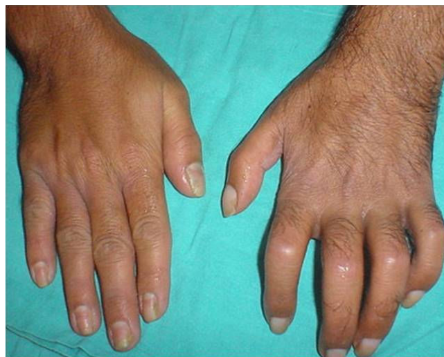
Figure 1 Typical features of CRPS. Note the hypertrichosis, edema, joint stiffness nail changes, skin atrophy, mirror image changes in opposite hand.

adjuvant were tried unsuccessfully. In the 10 th week, a trial of SGB with 10 mg Ketamine as an adjuvant was given after informed consent and midazolam premedication. He experienced 'light headedness', described as a pleasant floating sensation and reported dynamic VAS score to be 1. The pain relief lasted for 36 hrs. Thereafter, he received 3 days of continuous stellate ganglion infusion [0.0625% Bupivacaine with 0.5 mg Ketamine/day] @ 2 ml/hr. The improvement was rapid, VAS [static] remained 0, dynamic VAS [1,2], with reduction in the intensity of heat and mechanical allodynia [1–2/10]. Weight bearing physio-