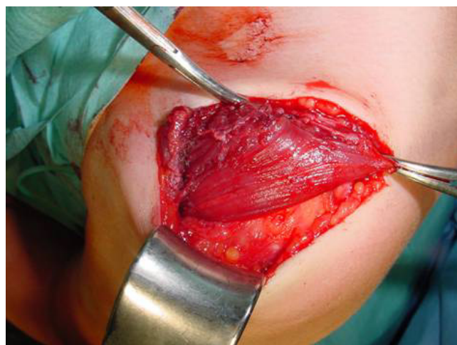
Figure 3 The muscle is positioned to replace/augment the anterior and lateral part of the deltoid muscle.

The midaxillar incision is closed over a little drain; the muscle is inserted unto the lateral clavicular rim unto the remaining dm with the arm positioned in 90° abduction and 20° flexion. This fixation is realized by several Maxon 2/0 sutures passed behind the rim suture on the tmm, so that a tight connection to the dm insertion unto the clavicle might be obtained.