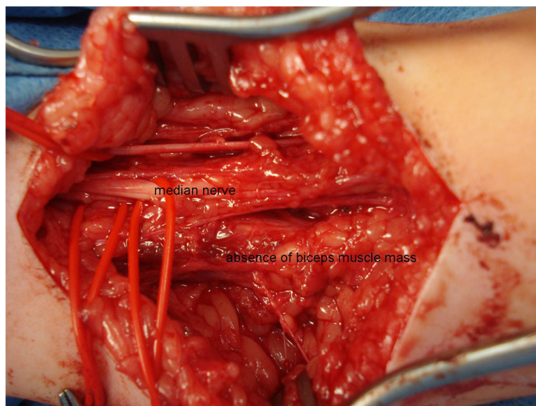
Figure 4 Other child: no functional biceps mass present.

Written informed consent was obtained from the patients' parents for publication of both case reports and any accompanying images and videos. A copy of the written consent for each case report is available for review by the editorial office.