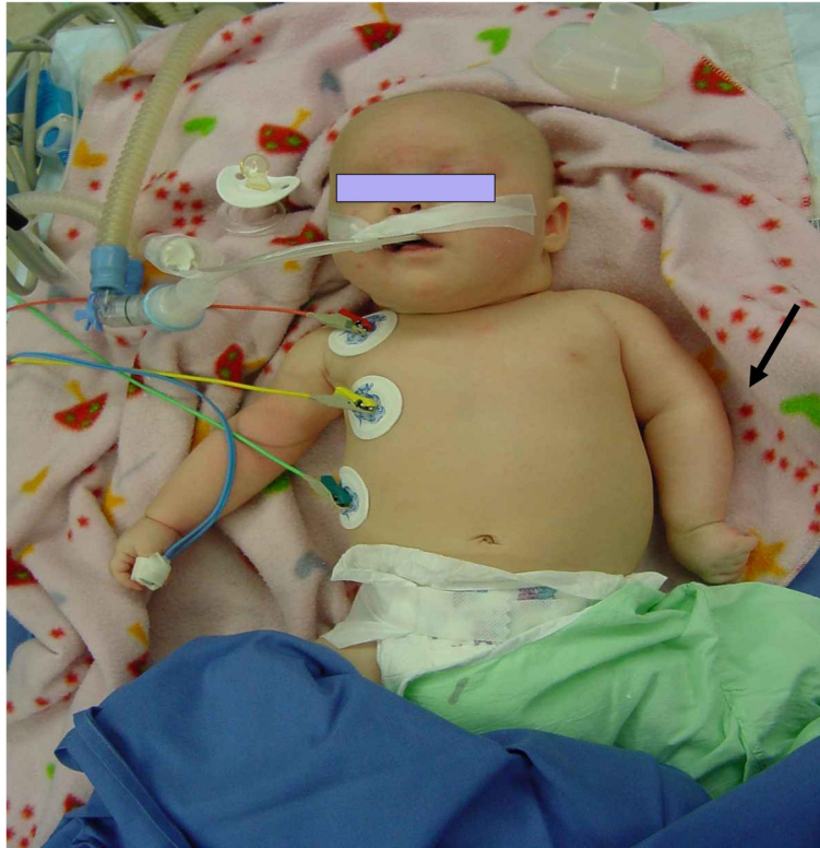
Figure 1 Patient 1 preoperatively. Left upper limb palsy, medial rotation position and hypotrophy.