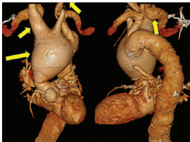
Figure 1. A 9.3 cm ascending aortic and aortic arch aneurysm, 4.0 cm innominate, 2.5 cm right subclavian (RScA) and 2.6 cm left common carotid artery (LCCA) aneurysm.