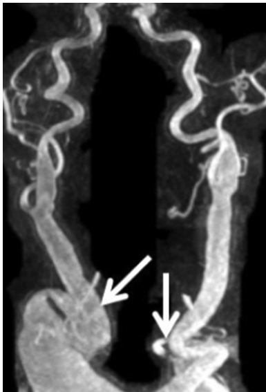
Figure 2. Torturous right and left carotid arteries.

artery (RAx) using the left subclavian artery (LScA). Bilateral supraclavicular incisions were used to expose the arch branch vessels. The left common carotid artery was divided distally to its aneurysmal portion and transposed onto the apex of the LScA.