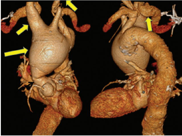
Figure 1. A 9.3 cm ascending aortic and aortic arch aneurysm, 4.0 cm innominate, 2.5 cm right subclavian (RScA) and 2.6 cm left common carotid artery (LCCA) aneurysm.