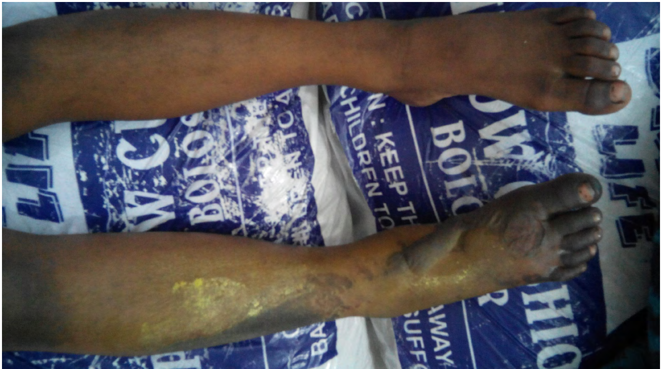
Figure 1. Preoperative findings show cool and mottled legs.

The lower limbs were warm by postoperative day (POD) 1. Sensation returned to both lower limbs on POD 2. Motor power (2/5) returned to both lower limbs on POD 3. Bowel and bladder functions were intact.