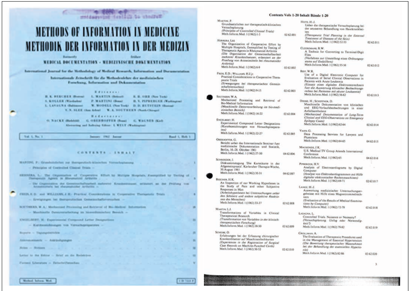
Fig. 1 Cover and part of the index of the first volume of the journal Methods of Information in Medicine, founded by Gustav Wagner in 1962.