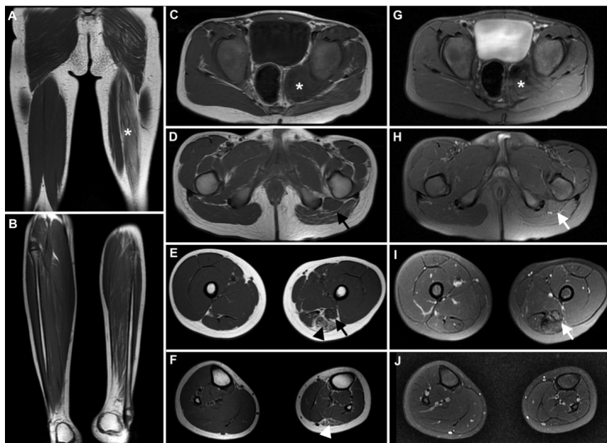
Figure 1. Muscle magnetic resonance (MR) imaging studies of the lower limbs. Coronal T1-weighted MR image of the thighs shows fatty substitution of the long head of the biceps femoris on the left thigh (asterisk) (A). Coronal T1-weighted MR image of the lower legs shows substantial asymmetry with diffuse hypotrophy of the left lower leg muscles in comparison to the contralateral unaffected side (B). Axial T1-weighted images of the pelvis (C), thighs (D and E) and lower legs (F) show a mass in the pelvis (C; asterisk) that merges with the left sciatic nerve (D and E; black arrows), which shows fusiform enlargement, with homogeneous intermediate signal intensity, similar to the adjacent muscle bellies. The fatty replacement of the long head of the biceps femoris (E; black arrowhead) and of the lateral head of the left gastrocnemius (F; white arrowhead) are shown. Axial T2-weighted fat-saturated images show intermediate signal intensity of the pelvic mass (G; asterisk) and the enlarged sciatic nerve (H and I; white arrows). Homogeneous intermediate signal in T2- and T1-weighted images similar to adjacent muscle bellies is highly suggestive of neuromuscular choristoma (asterisk and arrows).