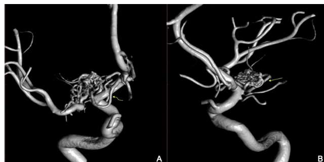
Figure 2. (A) 3D-rendered angiographic image in frontal view demonstrating contributions from the anterior cerebral artery (curved arrow) to the tangle of vessels reconstituting the distal M1 segment. (B) Lateral view of the same 3D image indicating the contribution of the anterior choroidal artery complex to the distal M1.