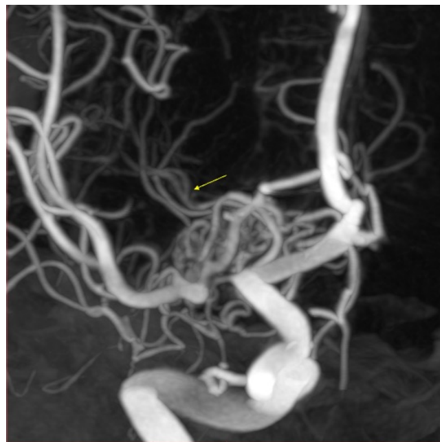
Figure 3. Multiplanar reconstruction of rotational angiography showing the presence of lenticulostriate arteries (arrow) arising from the anomalous proximal rete middle cerebral artery.