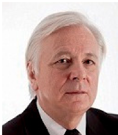
Figure 5. Professor Andrew J. Lees (1947 - ).

"A soft whistling incantation breaks the silence. Yellow and green iridescent zigzag spectra and indigo and argent helices are under my eyes, ultramarine charges come out of my arms. ...The flashes of beauty intensify as I stagger from the lodge... Phosphenes, coiled floating chains and aerolitos flash above me. Images unwind from the windmills of my mind" 8 .