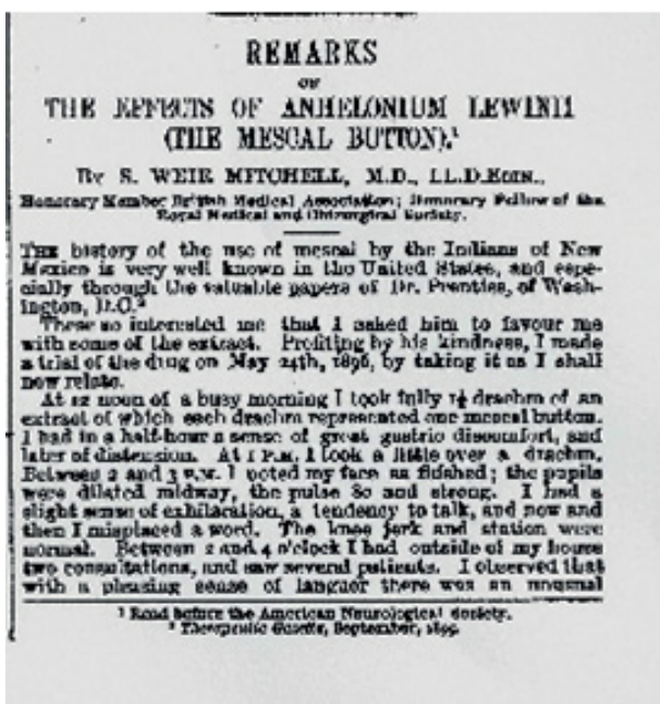
(Reproduced from British Medical Journal, 1896) Figure 4. Mitchell's paper about the effects of mescal.