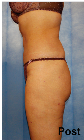
Figure 7: Post-liposuction patient 2

lure a novice plastic surgeon to overlook the importance of experience in achieving good results. Skin retraction assessment is an area where there is no alternative for experience. We always inform our patients that part