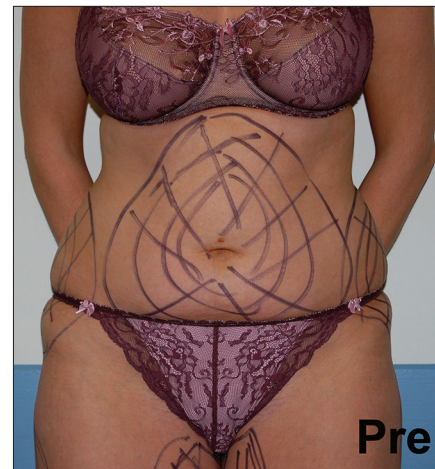
Figure 4: Pre-liposuction patient 2