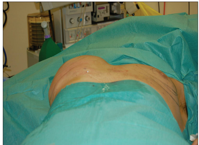
Figure 1: Tumescence in gynaecomastia