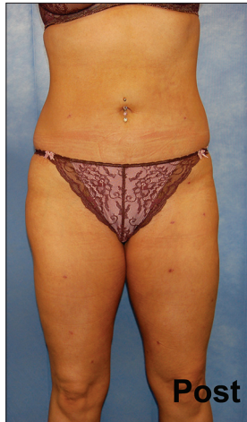
Figure 5: Post-liposuction patient 2