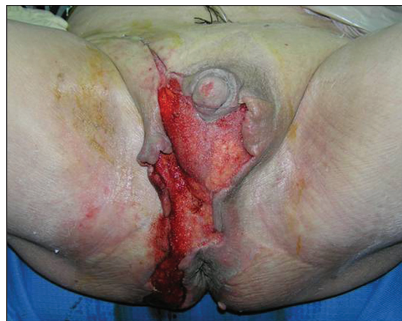
Figure 2: Post-operative 21 days later surgery. The healthy granulation tissue throughout wound