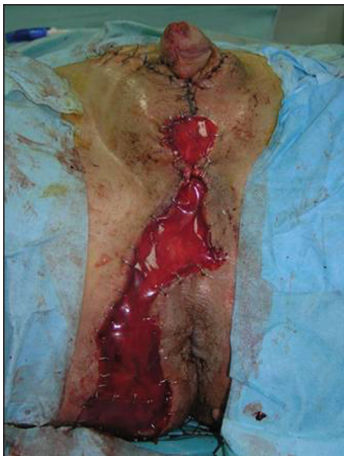
Figure 3: Intraoperative view following Integra application. Surgical application of dermal regenerative template

Wide surgical debridement of all necrotic tissue, including skin, subcutaneous fat and fascia, frequently lead to defects that present a reconstructive challenge. Reconstruction of the genitalia and perineum require wound coverage without affect the urogenital and anorectal function. Furthermore, the high bacterial count in this area of the body predisposes to a significant risk of infection and wound breakdown. Surgical options comprise primary or secondary wound closure, skin grafting, local advancement flaps, fasciocutaneous flaps, muscle flaps, myocutaneous flaps or perforator flaps. [5-12] The choice of wound management should be