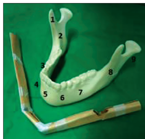
Figure 2: Segments of mandible

Reconstruction plate is used in very high risk or poor prognosis patients or as a spacer for definitive reconstruction at later date. In distraction osteogenesis and tissue engineered mandible, it obviates the need of bone graft. However, both are time consuming procedure.