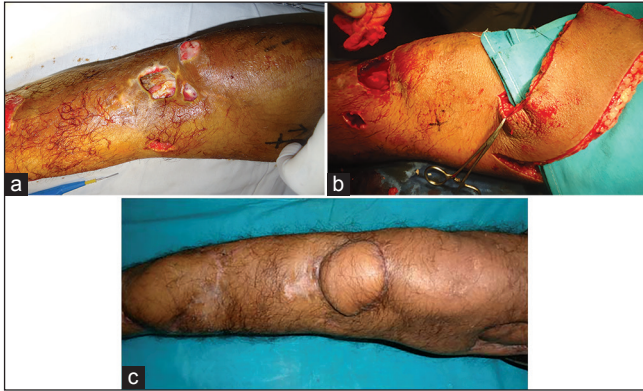
Figure 2: (a) Soft-tissue defect over infrapatellar region before debridement. (b) Intra-operative photograph after inferiorly based anteromedial thigh fasciocutaneous flap was raised. (c) Long term follow-up photograph