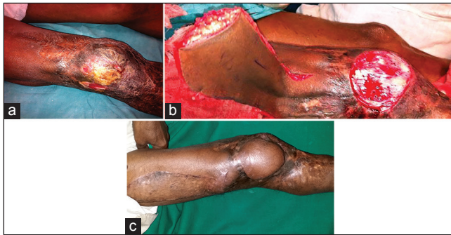
Figure 3: (a) Unstable scar lateral part of right knee with involved leg. (b) Soft-tissue defect after debridement and arc of rotation of the inferiorly based anterolateral thigh fasciocutaneous flap. (c) Post-operative photograph showing well set flap and skin grafted donor site

perforators. These perforators supply the overlying skin and underlying sartorius muscle. At least one supragenicular fasciocutaneous perforator always arises from the saphenous artery within 3 cm proximal to the adductor tubercle and it accompanies two venae comitantes. [5] Supragenicular fasciocutaneous perforator