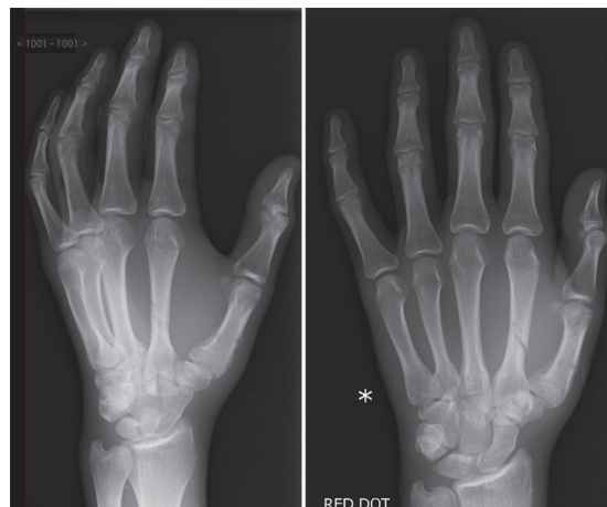
Figure 2: Radiograph demonstrating the adjacent second metacarpal fracture post removal of K-wires

K-wires crossing the fracture site can cause fragment distraction. K-wire convergence can create a pivot