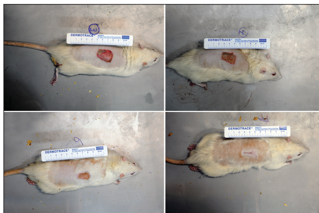
Figure 2: Improvement process of healing in green tea treated group

It has been clarified that green tea has multiple ingredients which have antioxidant activity and bioactive properties. One of these compounds is polyphenols (catechins, flavonols, theaflavins and thearubigins) which has been shown to be antioxidant and anti-inflammatory. Epigallocatechin-3-gallate (EGCG) is the main polyphenolic compound of green tea and may contribute in improvement of burn wounds and scars. [14,15]