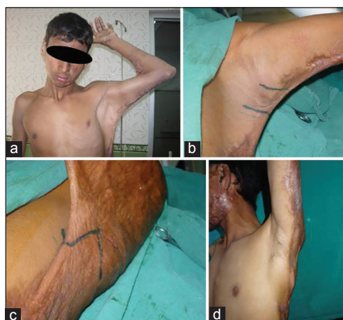
Figure 4: Type 1B contracture treated with square method flap. (a) Pre-operative photograph of the patient. (b and c) Intra-operative marking of the square flap and two triangular flaps. (d) Post-operative improvement showing increase in the degree of abduction to 160°

This is the procedure of choice for linear scar contractures of the anterior or posterior axillary folds if the surrounding skin is healthy. The technique is based on transposition of two triangular flaps. The incisions are designed to create a Z shape with central limb aligned with the part of the scar that needs lengthening. A 60° Z-plasty causes