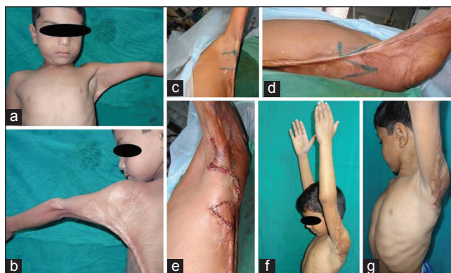
Figure 2: Type 1B contracture treated with square flap method. (a and b) Pre-operative photographs of patient showing scarring of posterior axillary fold and an abduction of 70°. (c and d) Intra-operative flap markings. (e) Immediately post-operative photograph. (f and g) 1-year post-operative; increase in the degree of abduction to 180°

Rehabilitation of axillary contractures is a challenge for reconstructive surgeons. Difficulty in management arises due to joint stiffness, difficulty in splinting and a high