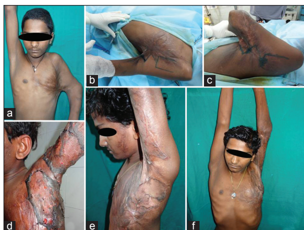
Figure 1: Type 3 contracture treated with local flaps. (a) Pre-operative photograph of the patient, with only 20° abduction. (b and c) Intra-operative flap markings with flaps being raised from anterior and posterior adjacent healthy skin. (d) 1-week post-operatively. (e) 6-month post-operatively. (f) 1-year post-operatively; increase in the degree of abduction to 170°

contracture were taken up for the study. Demographic details are mentioned in Table 4. Most common cause of burn was thermal injury. Scalds were seen less often; mainly in the paediatric population. None of the patients had undergone initial splinting or physiotherapy.