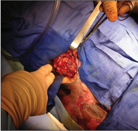
Figure 5: Caecum hernia with perforations

the donor site. On the left lumbar area, sutures to repair the colon repeatedly failed to hold. We then decided to convert the perforated colon into a colostomy [Figures 10 and 11]. When the patient was well enough to be ambulatory, she was transferred to a rehabilitation centre.