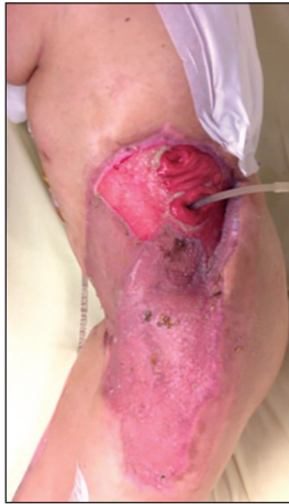
Figure 11: Left colostomia remaining