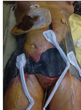
Figure 8: Negative pressure large wound therapy dressing