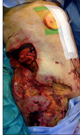
Figure 6: Right abdominal debridement with epiploon flap on right flank