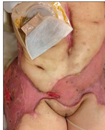
Figure 10: Result 3 weeks after skin graft (abdominal view)