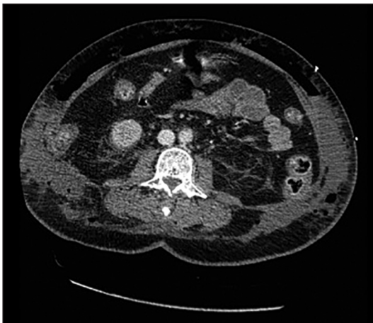
Figure 3: Bilateral lumbar hernia with caecum hernia