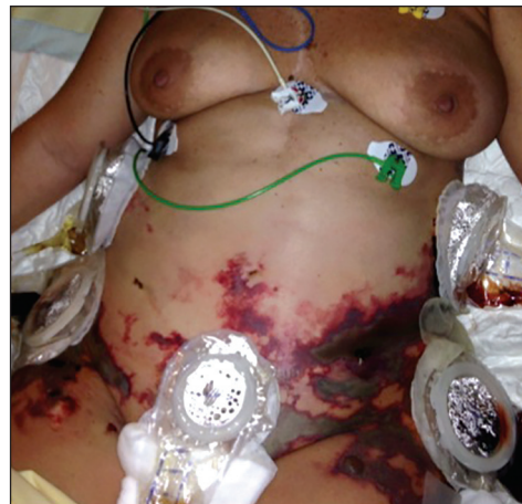
Figure 4: Pre-operative view