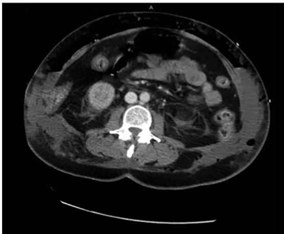
Figure 1: Subcutaneous air in the anterior abdominal wall

After a period of 12 days, her condition stabilized enough for us to perform surgery. We performed extensive debridement of all necrotizing tissue injuries. In the area of the right lumbar hernia, there were multiple perforations in the ascending colon and the caecum [Figure 5]. A colostomy was made in the remaining healthy skin, in the right hypochondrium. We next dissected an omental flap to repair the right lumbar hernia [Figure 6]. During left lumbar debridement, in the area of the left lumbar hernia, we found multiple perforations in the descending colon [Figure 7]. There was no reliable flap on hand to cover this area and hence we decided to close this perforation. She had no sign of peritoneal infection. Negative pressure large wound therapy (NPWT) with 2 motors was initiated [Figure 8].