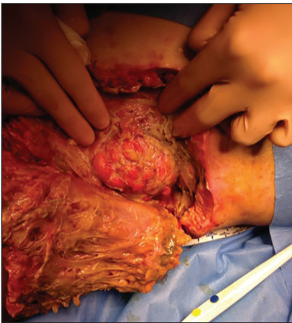
Figure 7: Left lumbar hernia with descending colon perforation