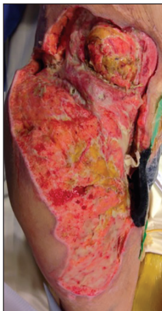
Figure 9: Wound healing on right side with granulation tissue on epiploon flap