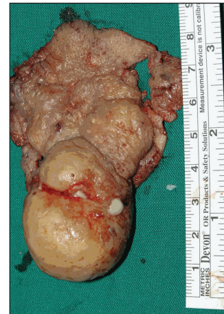
Figure 3: Exicion of rhinophyma from nasal dorsum