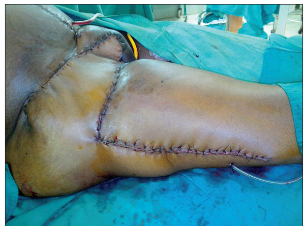
Figure 4: Immediate post-operative picture of “Z” transposition flap