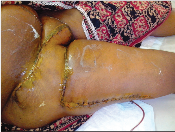
Figure 5: Post-operative day 12 following surgery

Our Flap dimensions ranged from 16 cm × 8 cm to 22 cm × 10 cm and all the donor defects were closed primarily. All the flaps did well without any complications [Figure 5].