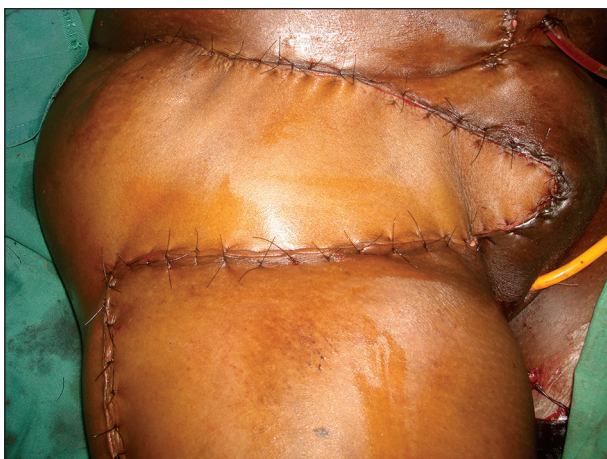
Figure 3: Immediate post-operative picture “V” flap