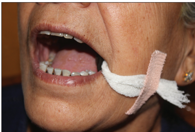
Figure 3: Biteblock fastened to the cheek

We have used this technique in various patients who include; patients undergoing surgeries for intraoral reconstructions, TMJ ankylosis and to those patients with restricted mouth opening following buccal mucosa fibrosis due to soft tissue involvement for whom release with grafting has been done but require postoperative splintage. In all these cases, the method proved effective