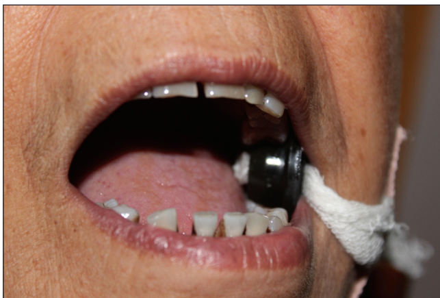
Figure 2: Intraoral view of the biteblock