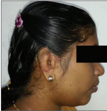
Figure 17: Low hairline - prior to LASER therapy