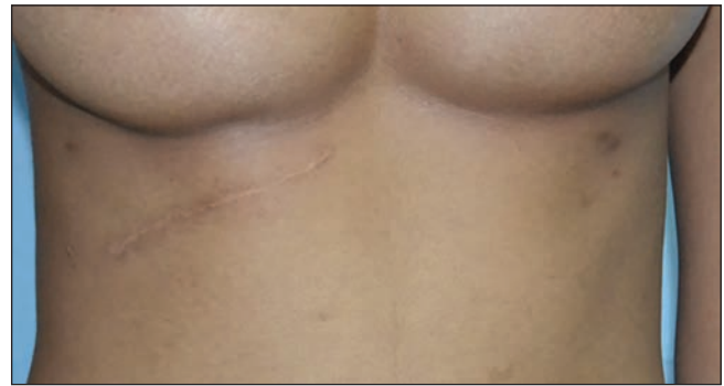
Figure 5: Good chest wall contour

to the use of 4-0 polypropylene, 3-0 polydioxanone for suturing the framework components. This was necessitated by the lack of availability and the prohibitive cost of the stainless steel wire sutures. We also tried to use thin dental wires looped onto eyed needles in few cases, but we found that the larger needle of suture materials cuts through the delicate framework components. There have been instances of a shift in the position of the framework components after placement in the pocket while using polypropylene and polydioxanone. The self-fabricated steel wires were difficult to manage and had inherent problems of undue thickness of the wires as well as needles. The commercially available stainless steel wires provide excellent stabilization of the components of the cartilage framework. The protruding wires on the under-surface of the framework act like barbs and help in preventing the movement of the construct by anchoring it to the underlying soft tissues. It also allows us to join even the small components in