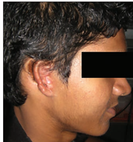
Figure 20: Average result