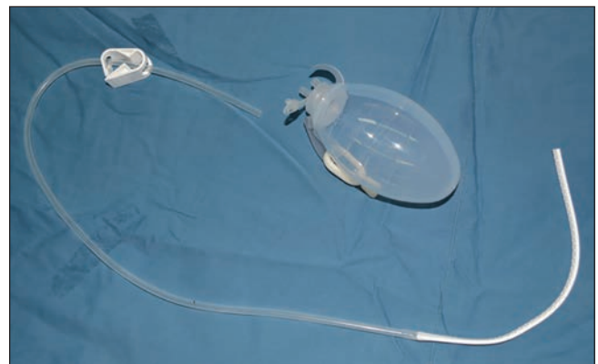
Figure 12: Silicone suction drain