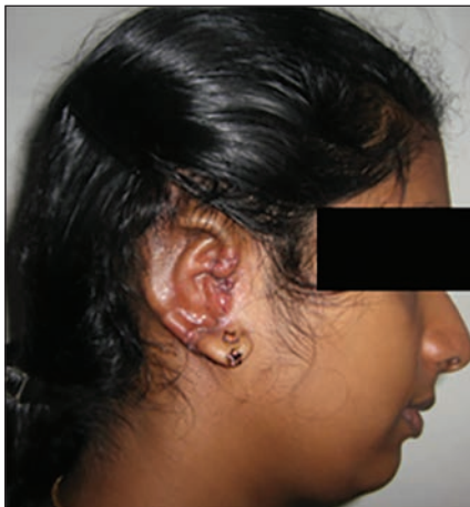
Figure 21: Good result