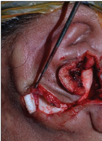
Figure 10: Augmentation of framework by banked cartilage