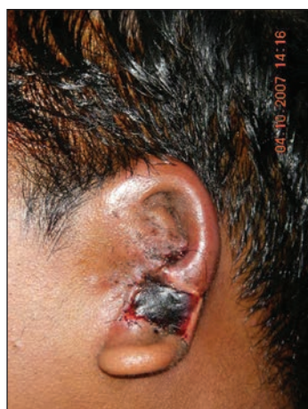
Figure 2: Skin necrosis in primary lobule transfer

Even though stainless steel wires had been used by Nagata and Firmin for a long time, we had resorted