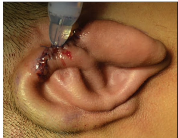
Figure 14: Cyanoacrylate tissue adhesive to seal off the suture line