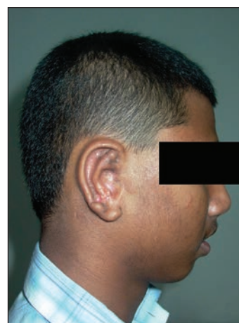
Figure 3: Delayed reconstruction providing stable and lasting results