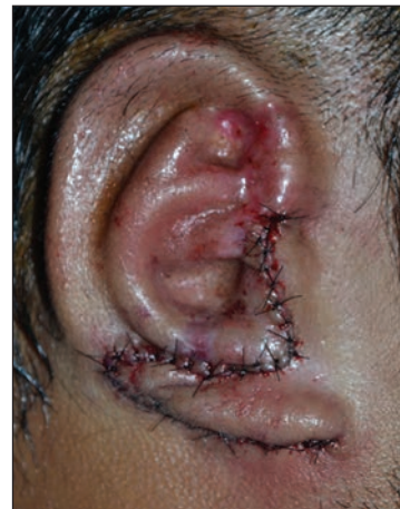
Figure 22: Excellent result

improve upon the existing results. Our adoption of different techniques and modifying them to suit the needs of Indian patients has started to give us more acceptable outcomes. Resorption of the cartilage, skin necrosis in single stage lobule transposition, difficulty to