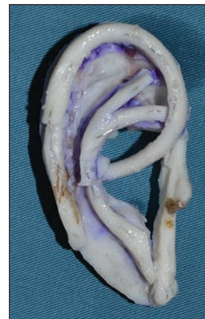
Figure 7: Two point tragal fixation

a reliable fashion enabling us to achieve a superior quality framework.