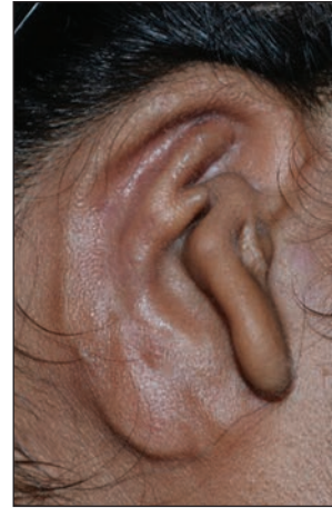
Figure 9: Framework after Stage I necessitating augmentation