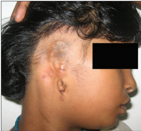
Figure 1: Framework resorption

for the cartilage framework yielded inconsistent results. However, after we brought in the modifications to the established techniques to cater to the native needs we were able to achieve excellent outcomes in about 70% (8 out of 11) of our patients. These steps included delaying the reconstruction, allowing for cartilage maturation, combining some aspects of all the three methods that is, Nagata, Firmin and Brent, and the use of additional techniques like triamcinolone injections and cartilage augmentation. Based on our experience we propose the optimal steps and guidelines for microtia reconstruction in Indian patients.