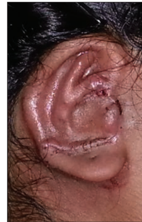
Figure 11(a): Augmented framework