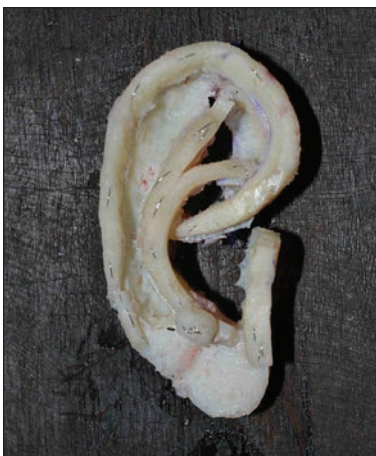
Figure 11(b): Completed framework