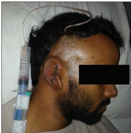
Figure 13: Suction drain brought out through a long subcutaneous tunnel

An objective, weighted grading system has further enabled us to critically evaluate the outcomes and to