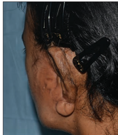
Figure 16: Contralateral post auricular full thickness skin graft