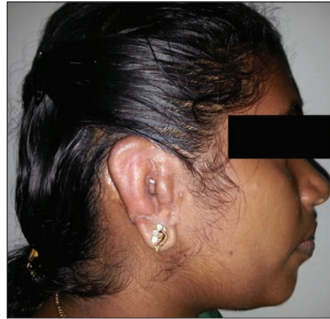
Figure 18: Low hairline — post LASER therapy