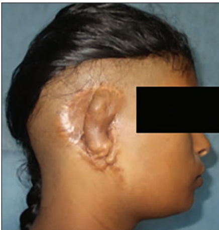
Figure 19: Poor result