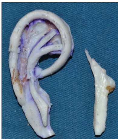
Figure 6: Creation of tragus from a single piece of cartilage

to the use of 4-0 polypropylene, 3-0 polydioxanone for suturing the framework components. This was necessitated by the lack of availability and the prohibitive cost of the stainless steel wire sutures. We also tried to use thin dental wires looped onto eyed needles in few cases, but we found that the larger needle of suture materials cuts through the delicate framework components. There have been instances of a shift in the position of the framework components after placement in the pocket while using polypropylene and polydioxanone. The self-fabricated steel wires were difficult to manage and had inherent problems of undue thickness of the wires as well as needles. The commercially available stainless steel wires provide excellent stabilization of the components of the cartilage framework. The protruding wires on the under-surface of the framework act like barbs and help in preventing the movement of the construct by anchoring it to the underlying soft tissues. It also allows us to join even the small components in