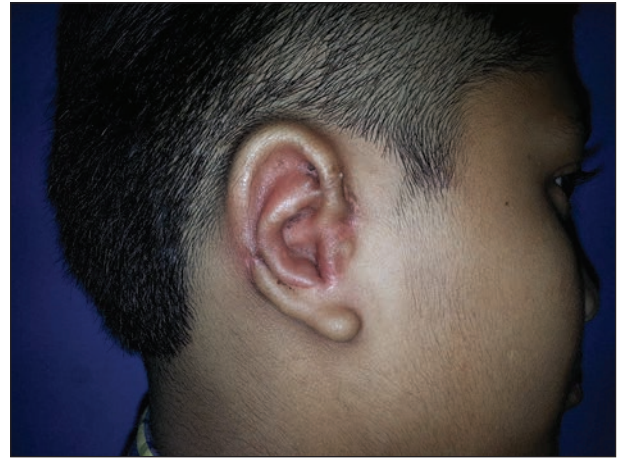
Figure 23(b): Excellent result — Post op