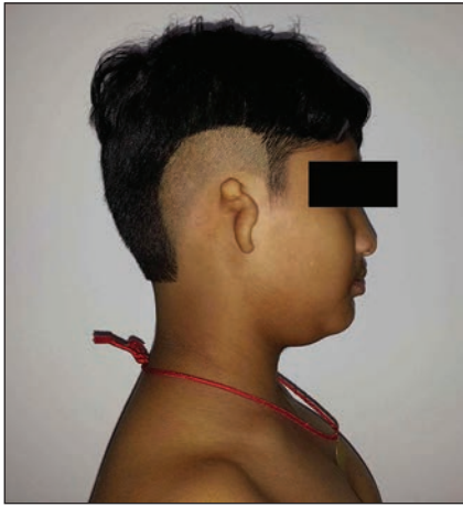
Figure 23(a): Excellent result — Pre-op