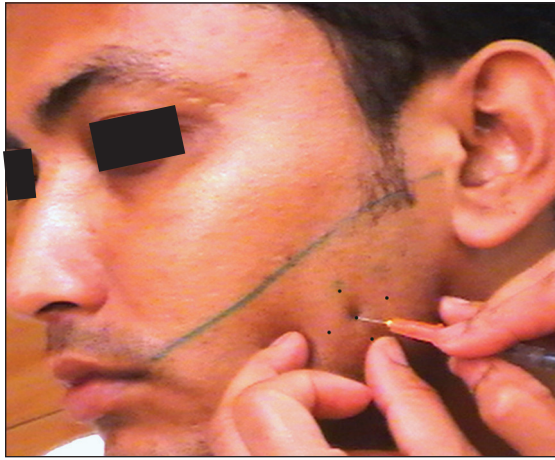
Figure 3: Defining the “safe zone” marking for the masseter muscle. The superior border of muscle is marked by green line, the anterior border being palpated with middle finger of left hand while 29 gauge needle being used to inject the toxin at its most prominent region in a diamond shape (marks shown as dots)

2005, Kim et al. recommended 100- 140 units of Dysport (Ipsen Ltd, Slough, United Kingdom) for 10- 16 mm thickness while Choe et al. suggested using > 20 IU of Botox (Allergan, Inc., Irvine, California) for any thickness >10 mm. [1,5] Recently, Xie et al. classified the masseter hypertrophy and tailored the dose of T-ABT for defining the number, dosage, effect, and complications of the drug. [6] Overall, the literature suggests 20-50 IU of T-ABT/ muscle for treating the masseteric hypertrophy. [6] Following T-ABT, most patients experience the reduction in muscle mass (atrophic effect) at 2-4 weeks with an average reduction being 31% of muscle thickness. [4] However, the duration of toxin effect varies individually, hence not predictable.