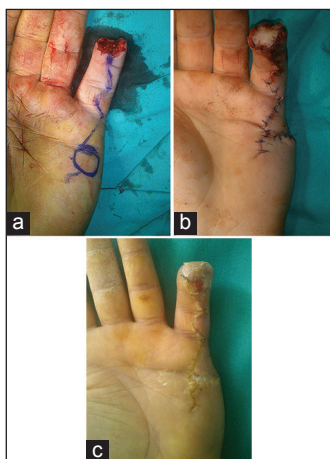
Figure 3: (a) Preoperative view, (b) immediate postoperative view and (c) postoperative view, after 3 months

Digital soft-tissue reconstruction has been developed using the knowledge of the small digital arteries and the different angiosomes located on specific zones of the hand. [15] The reverse hypothenar flap anatomy has been described earlier, including the number of perforants found and the maximal size of the skin island permitted. [1,2,8,9] Primary closure of donor site is an advantage compared to many other homodigital flaps. The Allen test is necessary because the ulnar palmar digital vessel is divided at the proximal end and vascularity of the finger entirely depends on the integrity of radial digital vessel. Pan-Deng Hao et al. recommended that