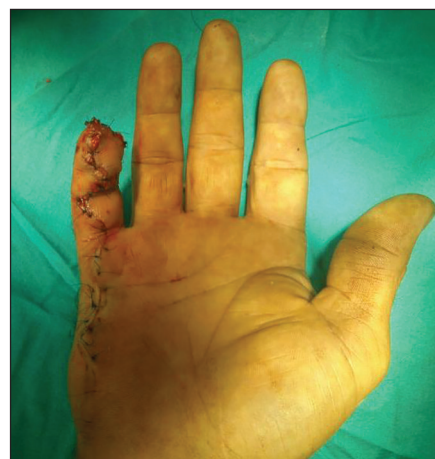
Figure 2: The donor site is closed primarily. Brunner incisions and Littler diamond incisions can be used together