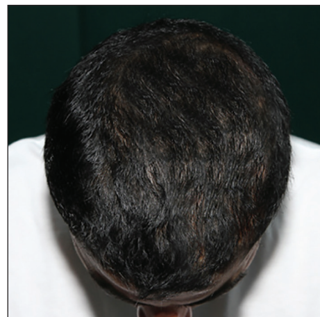
Figure 8: The result at 2 year follow-up