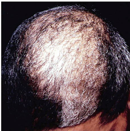
Figure 1: Grey hair over the scalp tumour

The turning of the knobs was made to just short of resistance, and stopped before the patient had discomfort [Figure 5]. With each act of turning of the distracters' knobs traction was applied on the adjacent scalp, which got expanded by about 1 mm. Within a period of 3 months, the wound edges had met each