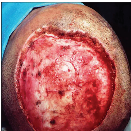
Figure 3: The excisional defect in the scalp