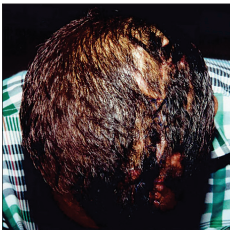
Figure 7: The external fixator was removed