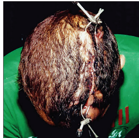
Figure 6: External tissue expansion completed. Note the normal scalp and natural hair on either side of the frame