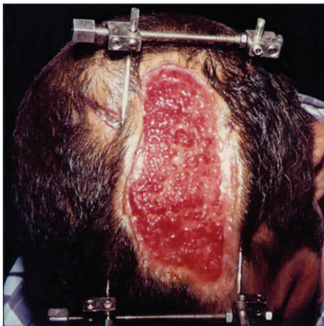
Figure 5: External tissue expansion in progress

A variety of skin stretching devices [3-13] are used to attain direct closure of surface soft tissue defects. However, they are either complicated, expensive, or for single use