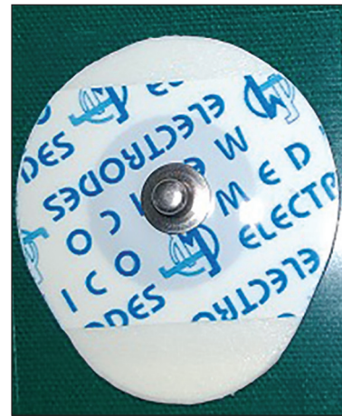
Figure 1: ECG lead (electrode)

This method of marking for flap monitoring is better, because there is no need to worry about the marking being erased with sweat and moisture, as it happens when marked with ink or the scored skin not being visible due to rapid epidermal healing.