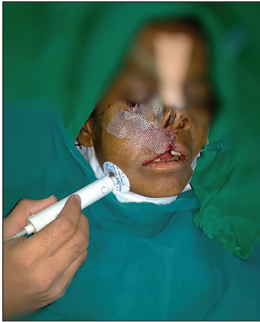
Figure 4: Doppler being done in a case of buried ALT flap in reconstruction of post-maxillectomy defect—vascular anastomotic site marked by ECG lead (electrode)

artery flap, free fibular flap, anastomotic site in cases of buried flap [Figure 4], when other conventional methods are not possible, and dorsalis pedis artery or radial artery in case of revascularization.