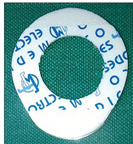
Figure 2: ECG lead (electrode) with a hole cut in the middle