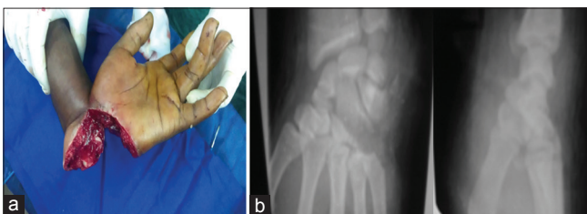
Figure 1: (a) Subtotal non-viable left-hand amputation, (b) pre-operative X-ray showing fracture of scaphoid, capitate, hamate and paracelar fracture of the base of the fifth metacarpal

On the third post-operative day passive motion of the shoulder, elbow and digits was commenced. On the 10 th day, the active motion of the wrist and digits was initiated within the confines of the orthosis by physiotherapy. At 3 weeks, the orthosis was removed for exercises and put for the rest of the day. At 6 weeks, the splint was totally removed. Special exercises to assist with activities of daily living were also done. Grip strength, forearm strengthening with rollers was