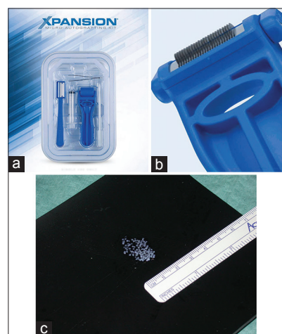
Figure 2: (a) Xpansion® micrografting handheld device, (b) parallel rotating cutting disc, (c) micrografts of uniform 0.8 mm × 0.8 mm size