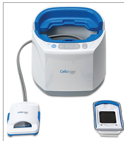
Figure 4: CelluTome™ epidermal harvesting system.

The use of epithelial and micro-blister grafts is limited to treating hypopigmented lesions such as vitiligo and congenital hypomelanotic conditions. Though it is successful in terms of graft uptake, the degree of pigment spread is inconsistent and variable in individual patients. [19] Apart from this, smaller acute and chronic wounds are also treated with the advantages of minimal donor-site problems. Epidermal grafts in addition to providing