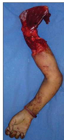
Figure 2: Amputated limb ( ventral aspect)