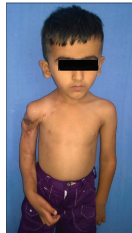
Figure 6: One year post-operative (frontal view)