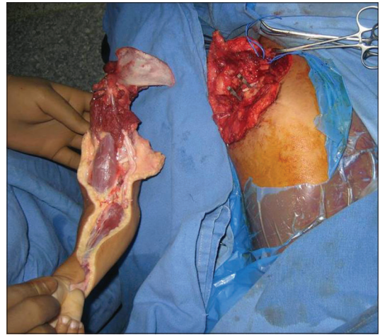
Figure 5: Amputated limb following fasciotomy and prepared amputation stump

day 27. The K-wires were removed on day 90 in the outpatient department, and the arm supported in a sling, and physiotherapy started [Figures 6 and 7]. The last follow-up at 18 months post-operative showed evidence