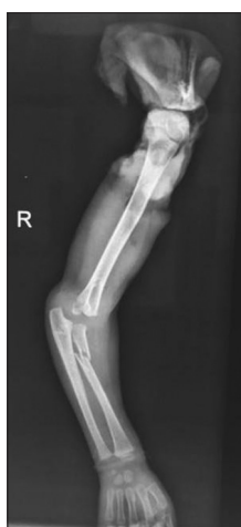
Figure 3: X-ray of the amputated part