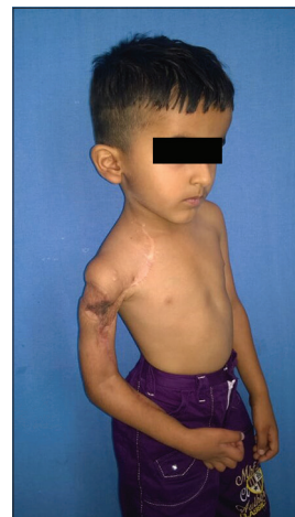
Figure 7: One year post-operative (oblique view)