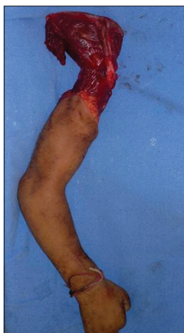
Figure 1: Amputated limb (dorsal aspect)