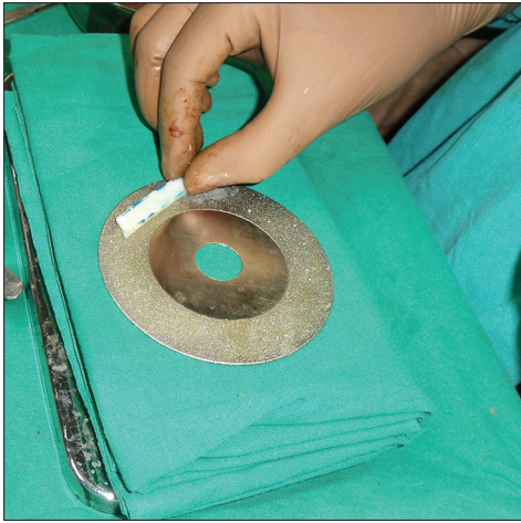
Figure 2: Costal cartilage graft smoothening using glass polishing disc

settings. Hence, the glass polishing disc is expected to behave similarly.