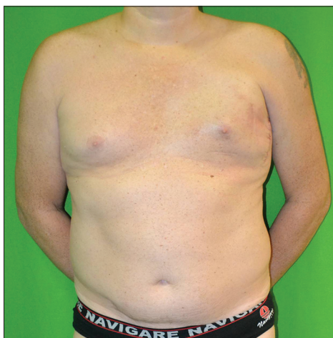
Figure 1: Preoperative picture, note the Baker 4 contracture

underwent an aesthetic surgery 25 years before, for placement of a silicon implant, but he developed a hard capsular contracture [Figure 2]. The visual analogue scale (VAS) score was 8. The indication for surgical treatment was not only cosmetic but also functional as the capsular contracture was painful. When the implant was removed [Figure 3] a gracilis muscle free flap was performed to improve the appearance of the chest wall. The gracilis flap was harvested from the right side. The muscle transfer procedure and the postoperative course were uneventful, and the patient left our hospital after 6 days. Physical therapy was started 4 weeks later. A clearly improved appearance was observed without any significant donor site morbidity. The gracilis flap survived. The follow-up period was 12 months. The VAS score dropped to 2. The patient had an excellent aesthetic result. No contralateral procedure was necessary as we did not observe any significant asymmetry [Figure 4].