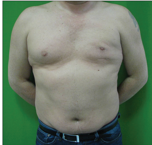
Figure 5: Postoperative picture

volume loss of muscle tissue resulting from neurogenic atrophy [Figure 5]. Although we presented only a case report and further evaluation is warranted with a larger series, we believe that a gracilis muscular flap is an optimal option for chest wall and anterior axillary fold correction in male patients with PS. This method combines minimal scarring, insignificant donor site morbidity, and an immediate excellent aesthetic result.