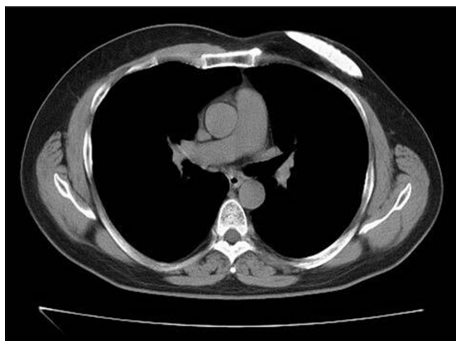
Figure 2: Computed tomography scans, chest wall with evidence of the prosthesis extrusion