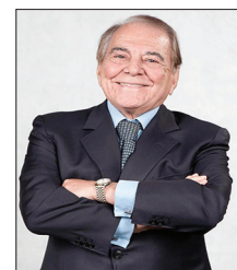
Dr. Ivo Pitanguy (1923–2016)

D r. Ivo Hécio Jardim de Campos Pitanguy was an Institution of Aesthetic Surgery and a one-man industry. He pioneered procedures that underpinned a burgeoning global industry and dedicated his life to helping people live a better and happier life. He often said, 'I saw the importance of saving lives and saving functions but it seemed that nobody gave importance to the stigma of deformity and how people suffered with that'. It is this stigma, which kept people away from friends and relatives and made them lesser individuals because of a lack of self-esteem, that prompted Dr. Pitanguy to take it up as a lifelong crusade and a challenge worth dedicating all his resources.