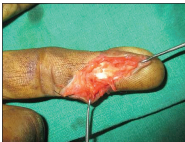
Figure 3: Intraoperative picture post-reduction with centralised profundus tendon