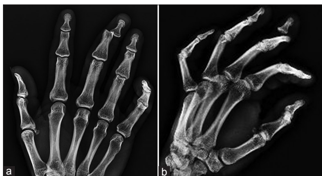
Figure 1: (a and b) X-ray views showing dorsoulnar distal interphalangeal joint dislocation with increased joint space

In a report and review of literature, Abouzahr and Poblete [6] found only 12 such cases reported till 1997 having included both open and closed dislocations. They