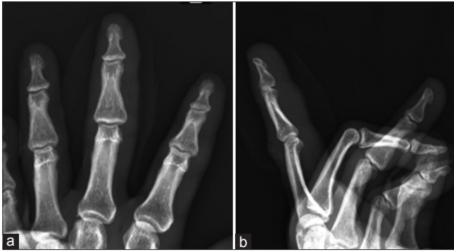
Figure 5: (a and b) Follow-up X-ray showing concentric reduction

concluded that volar plate interposition was the culprit in closed injuries while the buttonholed profundus tendon caused irreducibility in open injuries. This has been later contested by Banerji et al. in their report. [7] We also feel that, in our case, the displacement of the tendon was the primary impediment to reduction rather than the volar plate interposition. However, this interposition has to be identified and corrected before any attempt at joint reduction is made. Otherwise, it may become impossible to repair this structure post-reduction.