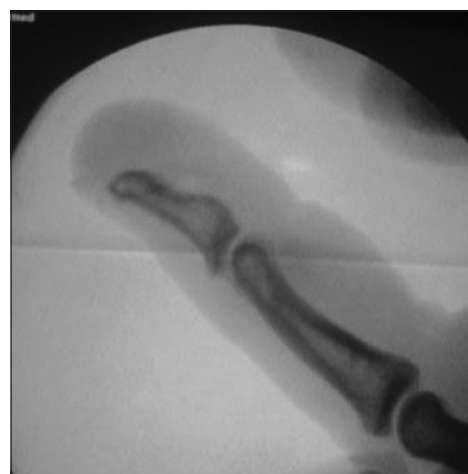
Figure 4: Concentric reduction of the joint on lateral view with image intensifier