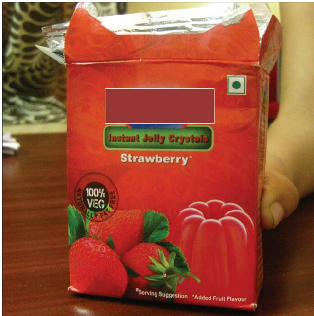
Figure 1: The jelly pack used to prepare the phantom