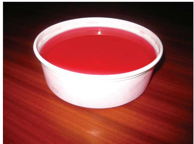
Figure 4: The appearance of the prepared phantom in a plastic bowl

Bude and Adler [1] described a phantom made using gelatin and psyllium husk. They used substances like grapes,