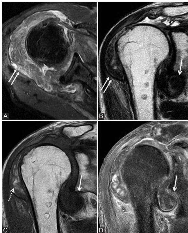
Figure 1 (A-D): (A) PD images show hyperintense signal in the thickened synovium (paired arrows). (B) T2WI spin echo coronal image shows hypointense and thickened synovium (paired arrows) with moderate joint effusion. (C) On T1WI, few foci of T1 shortening (interrupted arrow) are seen in the diffusely thickened synovium. (D) Post-contrast fat-saturated T1WI shows moderate enhancement in the soft tissue around the shoulder joint. The arrow points to signal void due to flow in patent aneurysmal sac which was misinterpreted initially

Computed tomography (CT) angiography (Toshiba Asteion