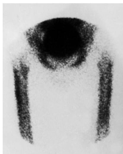
Fig 1a, 1b Bone scan showing intense bilateral symmetrical cortical uptake of Tc-99m MDP in tibia, fibula and femur, consistent with "Hypertrophic osteoarthropathy". The characteristic "tram line" sign is also seen.

From the Regional Cancer Center, Medical, College PO, TRIVANDRUM - 695011