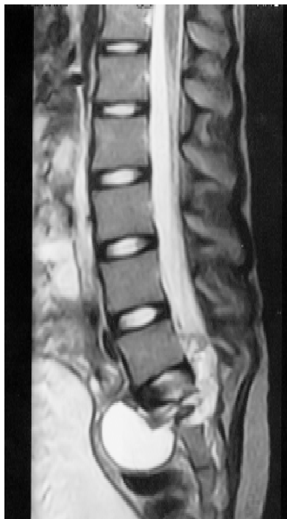
FIGURE 1: - S1 vertebral body shows hyperintense signal with fluid - fluid level and decrease in body height on T2 weighted images.

the cal sac to the right side. Neural foramina at S1 level on left side showed hyperintense signal within. Intervertebral disc contours and signal intensities were preserved at all visualized levels (fig. 1).