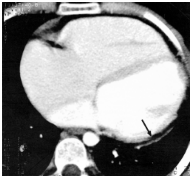
Figure 3. CT scans showed fatty infiltration in the myocardium of the left ventricle wall and also showed that the thickness of the left ventricle wall was 2 mm.

CT scans showed fatty infiltration (in minus HU values) in the subepicardial myocardium of the left ventricle wall and also showed that the thickness of the left ventricle wall was 2 mm (Figure 3).