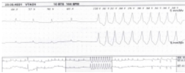
Figure 1. Holter monitorization showed episodes of sustained ventricular tachycardia in the form of LBBB (Originating from the right ventricle).