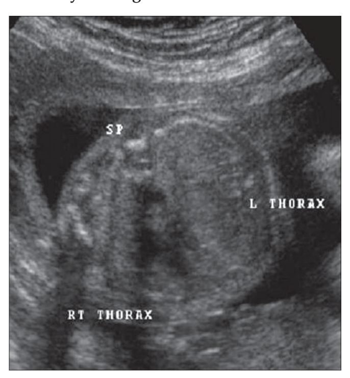
Figures 2: Transverse USG of the fetal thorax - four chamber cardiac view captured five minutes later.