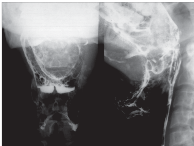
Figure 1: Barium swallow frontal and lateral views