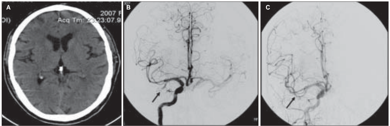
Figure 3 (A-C): Acute stroke. CT scan: Axial CT image (A) is normal. The catheter angiogram (B) shows occlusion of the inferior division of the right MCA (arrow), along with occlusion of the contralateral ICA. Repeat angiogram (C), after revascularization, shows that the occluded MCA branch has now recanalized (arrow)

which really at times is useless, we lose valuable time within the therapeutic window.