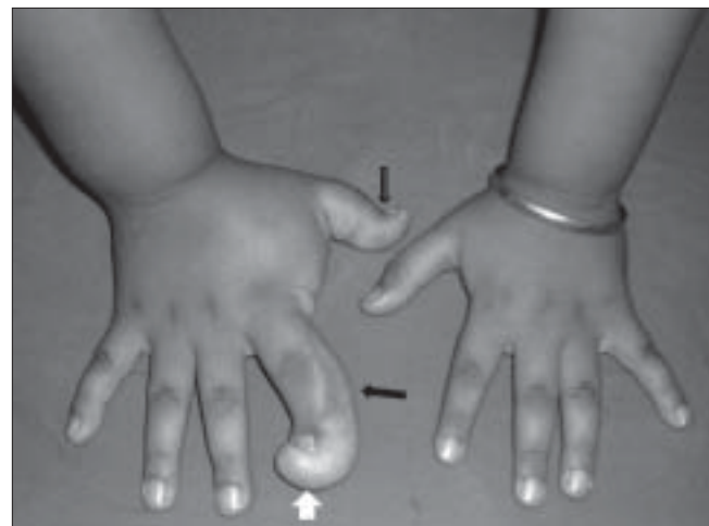
Figure 1: Case 1: Clinical photograph of both hands demonstrates the macrodactyly involving the thumb and index finger (black arrows) of the right hand and the dorsal angulation of the index finger (white arrow)

A 2-year-old right-hand-dominant male child presented with progressive enlargement and swelling of both dorsal