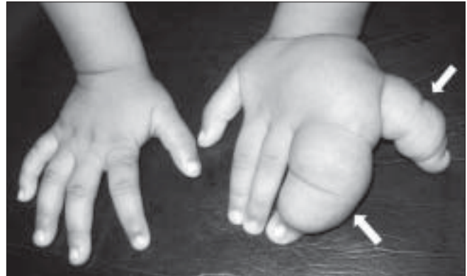
Figure 4: Case 2: A clinical photograph of both hands shows enlarged ring and little fingers (arrows) of the left hand as compared to the normal right hand

skin changes were present and the movements of the digits were normal. A radiograph revealed disproportionately enlarged left ring and little fingers; there was soft tissue swelling, along with dorsal angulation of the fourth finger and lateral angulation of the fifth finger [Figure 5]. MRI depicted fatty tissue proliferation around the left fourth and fifth digits, which was more along the dorsal aspect [Figure 6]. There was no medullary or periosteal abnormality.