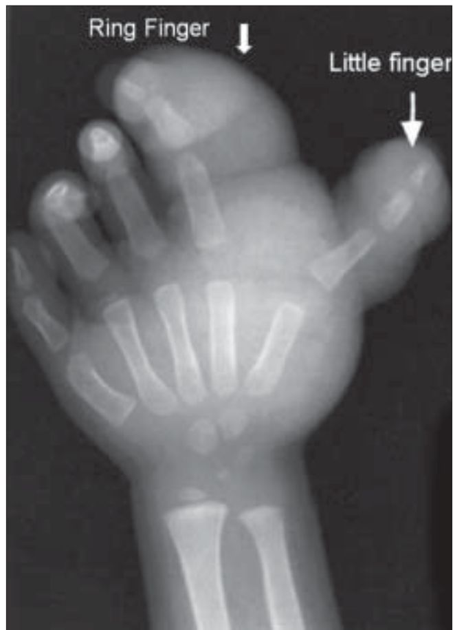
Figure 5: Case 2: Plain radiograph of the left hand shows soft tissue swelling (arrows) causing enlargement of the ring and little fingers, along with dorsal angulation of the former and lateral angulation of the latter