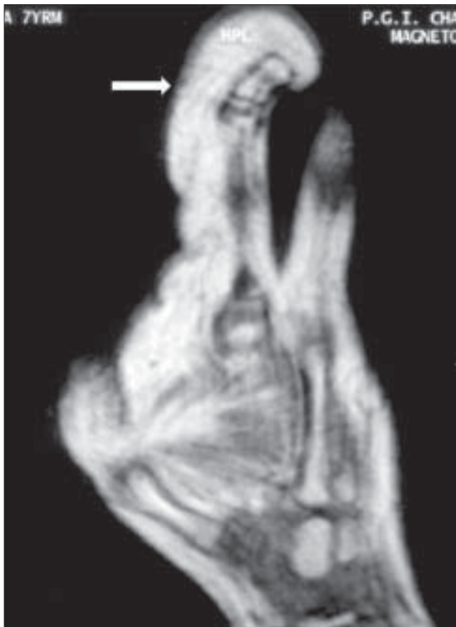
Figure 3: Case 1: Sagittal T1W MRI image reveals proliferation of fatty tissue (arrows) on the volar aspect of the index finger with signal intensity similar to that of subcutaneous fat; there is dorsal angulation of the affected digit