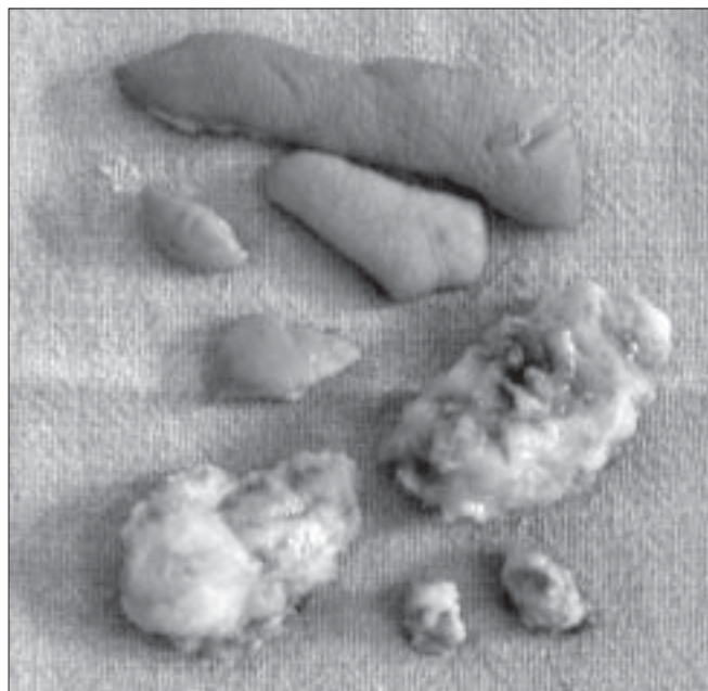
Figure 7: Case 2: Photograph shows the excised predominantly adipose tissue

MDL usually presents at birth and may be associated with