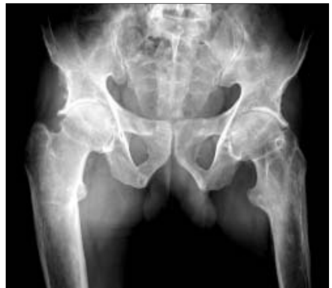
Figure 4: Anteroposterior radiograph of the pelvis (including both hips) shows symmetric and shaggy periosteal proliferation in the lower part of the iliac bones. There is widening of the femoral metaphyses with reduction of hip joint space on both sides, without any abnormality of the articular surface