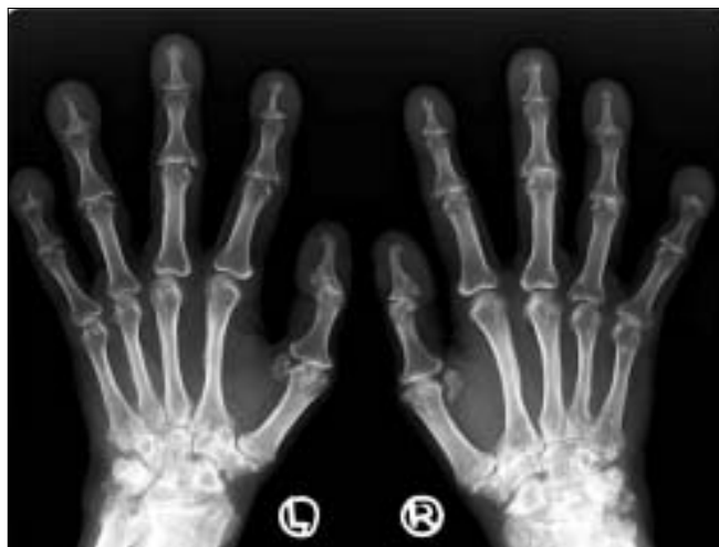
Figure 3: Anteroposterior radiograph of both hands shows enlargement of the distal fingers with acroosteolysis, along with modeling deformities of the sesamoid bones, reduced joint spaces at the carpus and the proximal and distal interphalangeal joints, periarticular osteopenia, and joint deformities

[Figure 5]. A radiograph of the chest was unremarkable, while that of the spine revealed spondylotic changes with loss of lumbar lordosis.