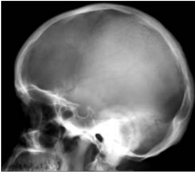
Figure 5: Lateral radiograph of the skull shows hyperostosis of the calvaria and skull base bones with a normal sella and sinuses