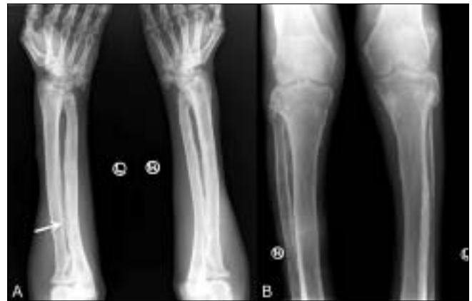
Figure 2 (A,B): Anteroposterior radiographs of both forearms (A) and upper legs (B) show symmetric, shaggy periosteal proliferation extending up to the epiphyses, with expansion of the radius and ulna at the wrist and of the tibia and fibula at the knee, along with calcification of the interosseous membranes (arrow)

Based on the clinical and radiological findings, a diagnosis of the classic or complete form of PDP or idiopathic hypertrophic osteoarthropathy was suggested. Histopathological examination of the skin demonstrated an increase in dermal collagen, hyperkeratosis, and acanthosis, with no evidence of any acid-fast bacilli.